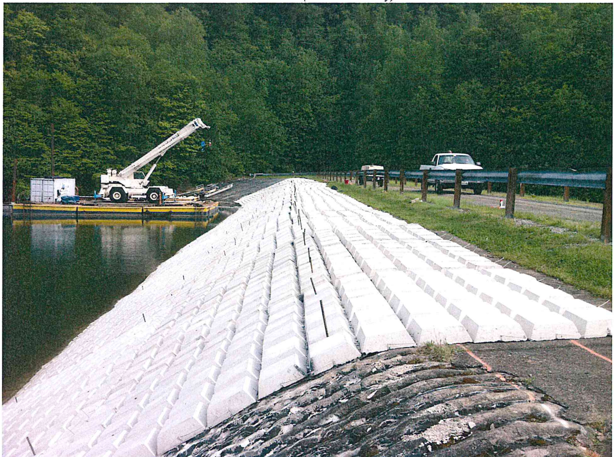
Articulated Concrete Block Mat Revetment (Illustration only)

June 3, 2019 – Meeting held in Raleigh with NC Dam Safety, NCDOT, City staff and consultants to establish agreeable parameters with NCDOT and NC Dam Safety to restore Pine Lake and North Lake with new High Hazard Dam classifications due to NC Dam Safety's determination that average daily traffic counts (ADT's) on E. Boiling Spring Road now require the High Hazard classification. Consensus of meeting was that a coffer dam to reestablish the water level and an articulated concrete block mat revetment (see below) to allow the road bed to serve as an emergency spillway which would allow water to overtop the road but not erode the bank may be feasible solution.