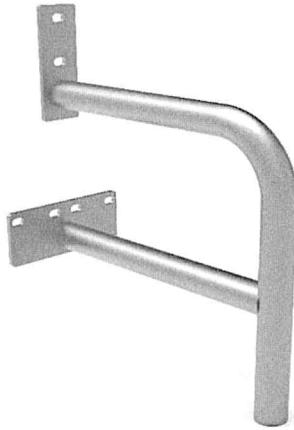
Entry Grab Rails